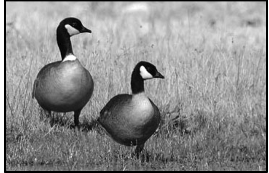
An Aleutian Goose (left) shares a nonpartisan moment with a Cackling Goose (right). Record numbers of Aleutian geese are making Humboldt County a migratory stopover.